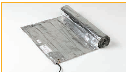
An example Combymat from the range