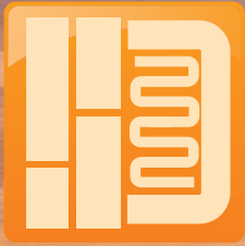
Underlamine Heating Mats